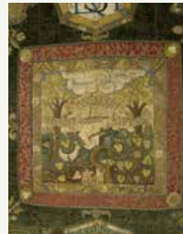
The Marian Hanging, Mary Queen of Scots, Elizabeth Countess of Shrewsbury, 1570-1585

During her imprisonment, Mary spent much of her free time embroidering. This is the Marian Hanging, one of her most famous for its feature of the royal arms of Scotland and Mary's monogram.