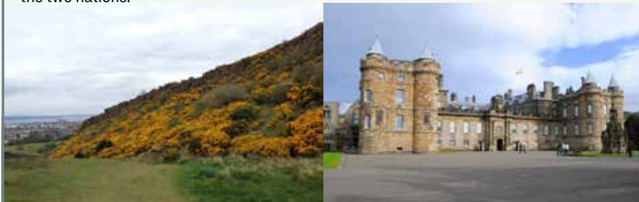
This house of power seem much older and outdated compared to the landscape and architecture of England.

Scotland's society was seen as being more backwards than England. Mary's father, James V, tried to bring Scotland into the Renaissance by cultivating things like music, art, and architecture. He built the Holyrood Palace where his daughter would later be born. Compare this palace to the Edinburgh Castle. See the different time periods that are represented. One shows the future of Scotland, the other, the past. Scotland remained in turbulent politics until James VI became James I of England and combined the two nations.