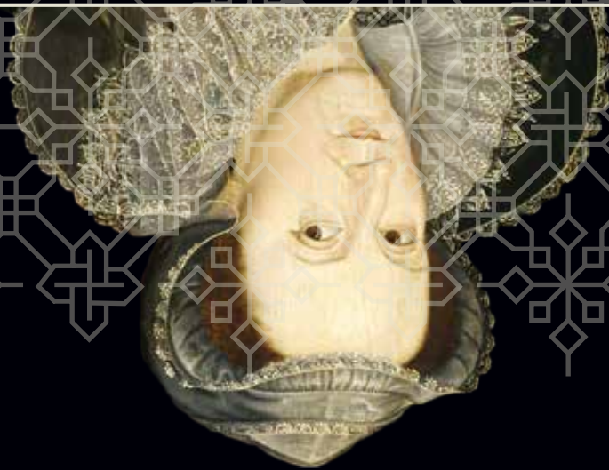
Mary Queen of Scots, Nicholas Hilliard, 1578, CC