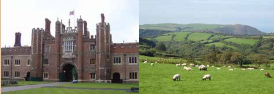
This is the Hampton Court Palace where Elizabeth spent much of her leisure time. You can see how modern and bright is it compared to the Scottish palace.

From Henry VIII on, England struggled with politics and religion. His Catholic daughter, Mary I, attempted to end all Protestantism in the kingdom. Elizabeth I became known for being tolerant of both religions. Culture flourished under Elizabeth. The period is well known for the development of the playwright, William Shakespeare, the painter, Hans Holbein, the philosopher, Sir Francis Bacon, and the pirateer, Sir Walter Raleigh, among others. With the defeat of the Spanish Armada in 1588, Elizabeth transformed England into the dominant world power.