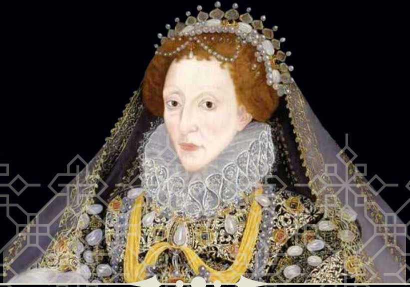
Portrait of Elizabeth I