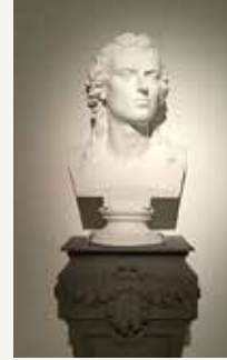
Bust of Friedrich Schiller

Schiller's initial works started in the Sturm und Drang movement of German Romanticism. He was a huge supporter of the French Revolution and the idea of people controlling their own lives until the beginning of the Reign of Terror. The lack of control and extensive death tolls during this time reformed Schiller's thinking in order to understand that revolution may not be the best route to gain freedom.