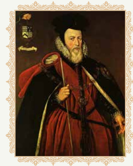
Portrait of William Cecil, Earl of Burleigh

Robert Dudley, the Earl of Leicester was Elizabeth's favorite for most of his life. Although they met as children, their real relationship began when both were imprisoned in the Tower of London during Bloody Mary's reign. They were never able to marry due to her rank and the fact that he was married.