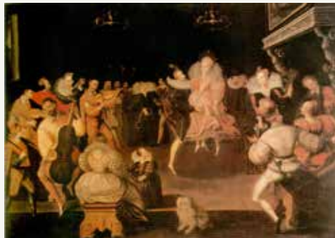
Robert Dudley and Elizabeth I Dancing the Volta, Marcus Gheeraerts, 1581, Public Domain

The Volta was one of Queen Elizabeth's favorite dances. It was the only Elizabethan dance to bring partners into close proximity with each other, and it required the man to lift the woman up by her hoop skirt.