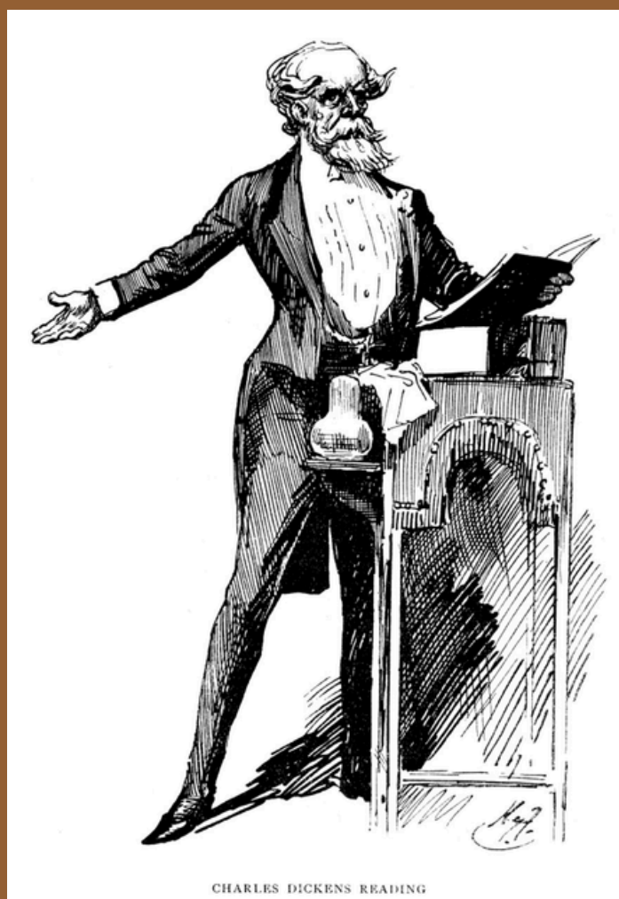
CHARLES DICKENS READING

Dickens' novels are extremely theatrical, and we have a tremendous opportunity to bring Great Expectations to life in a medium he loved so much.